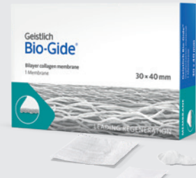
Geistlich Bio-Gide® Geistlich Bio-Gide® Compressed Geistlich Bio-Gide® Shape