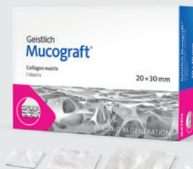
Geistlich Mucograft® Geistlich Mucograft® Seal

* Product availability may vary between countries